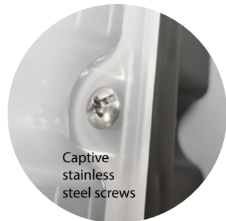
Captive stainless steel screws