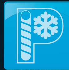
Heat Mat PipeGuard