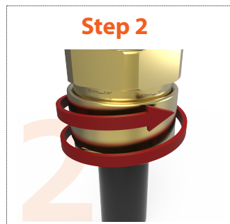
Tighten backnut until a seal is formed onto the cable, then tighten one further turn