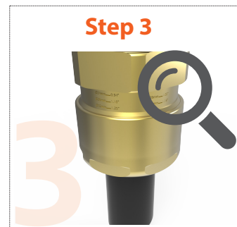
The backnut should be level with the marking guide corresponding to its diameter – this can be visually inspected and adjusted as necessary

Note: The cable gland installation instructions have a printed cable OD measure for if the cable OD is not known