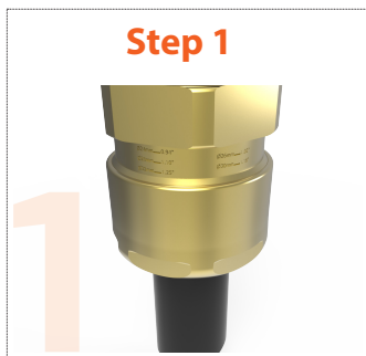
Follow cable gland installation instructions until final stage – tightening of rear seal

The gland is permanently marked with various lines/numbers indicating the correct tightening level related to the cable diameter. Following the relevant cable gland Installation Instructions, the back seal should be tightened until a seal is formed on the cable outer sheath and then tightened one further turn.